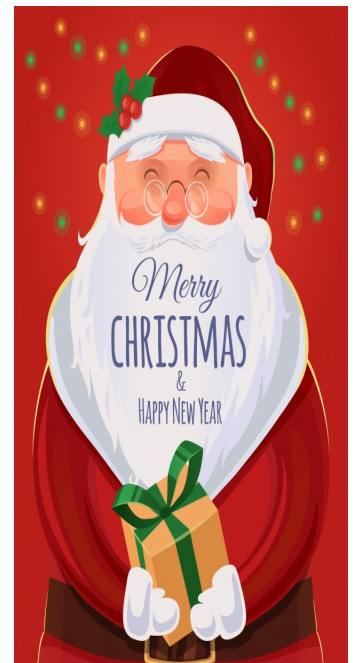
The Student Council would like to wish everyone a Merry Christmas and a Happy New Year!